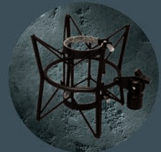
Optional Spider Shock Mount

Soundelux Microphones is a leading producer of high-end studio microphones. Its award-winning line of condenser mics, all handcrafted in the USA, are widely used in top music recording, film post-production and broadcast studios worldwide.