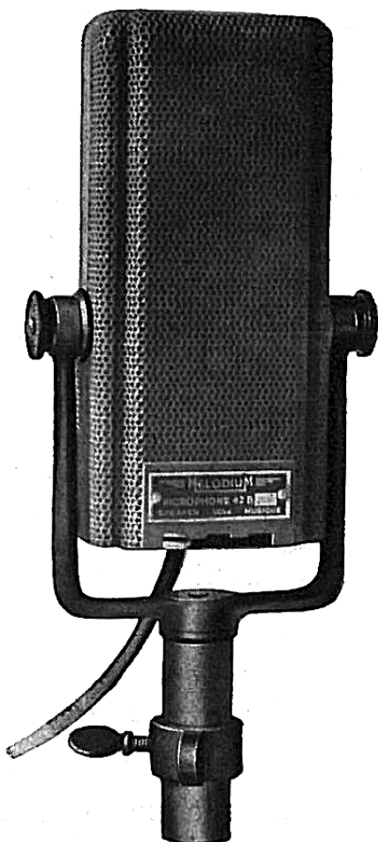
The MÉLODIUM Type 42 B ribbon microphone.